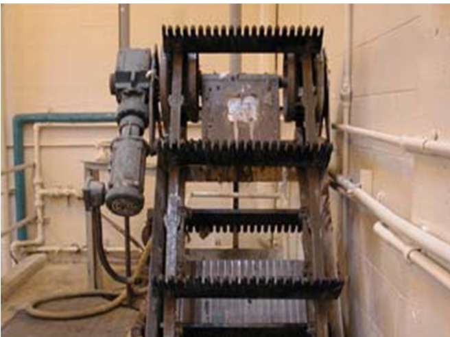
The Duperon ® FlexRake ® FP was commissioned in 1998 and has been running strong, and maintenance-free for over 20 years.