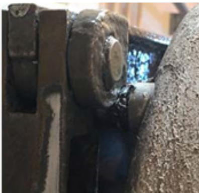
Link and pins

"... it saved tons of time and tons of maintenance costs because they are pretty much maintenance-free."